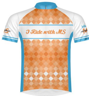
I Ride with MS