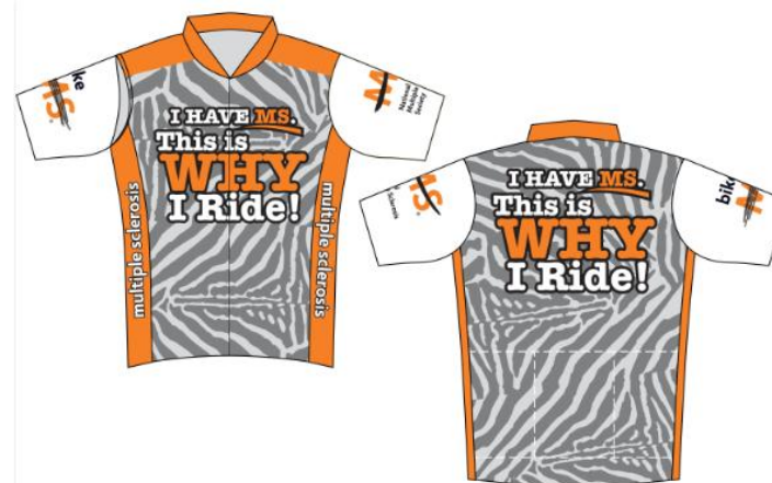
Because We Can